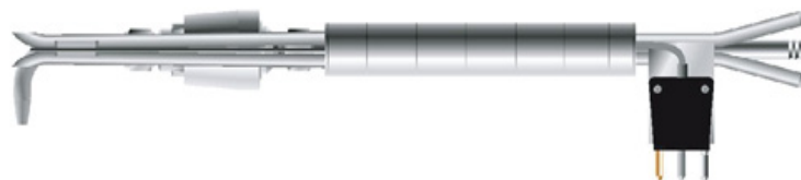
Ministack Isokinetic Sampling Kit: P/N AC99-104-0000KP

The solution is the new isokinetic probe named MiniStack. Thanks to its innovative filterholder, this probe can be used in stacks with section size from 150 mm to 600 mm. The MiniStack probe is composed by a filterholder and a one-block body which includes the Pitot tube, the temperature sensor and the suction tube.